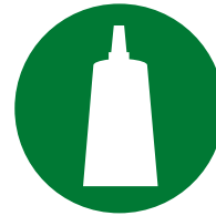
Installation / Assembly of accessories