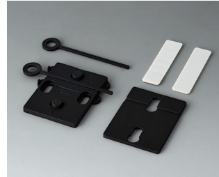
A9305019 Wall suspension elements ASA+PC (UL 94 V-0) black RAL 9005