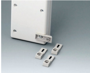
A9204108 Wall mounting brackets PA 6 pebble grey RAL 7032