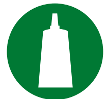
Installation / Assembly of accessories