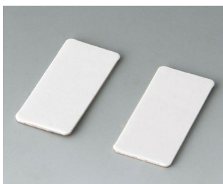
A9305147 Adhesive foil holder

Subject to technical modification without notice. © by OKW Gehäusesysteme, Buchen/Germany.