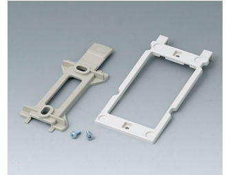
B1350048 Wall suspension elements ABS (UL 94 HB) pebble grey RAL 7032