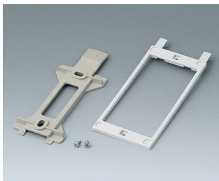
B1360048 Wall suspension elements ABS (UL 94 HB) pebble grey RAL 7032