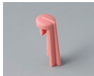
A1105003 Arrow PA 6 (UL 94 HB) coral