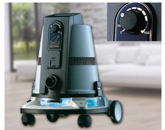
Operating element for a vacuum cleaner