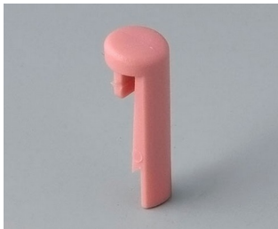
A1101003 Pin PA 6 (UL 94 HB) coral