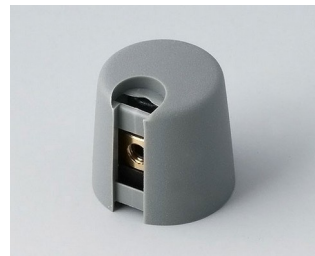
A1016068 TOP-KNOBS 16 PA 6 volcano 16x16mm 6mm