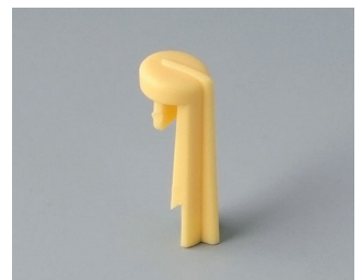
A1105004 Arrow PA 6 (UL 94 HB) beach