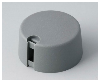
A1031648 TOP-KNOBS 31 PA 6 volcano 31x16mm