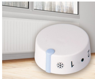
Integrated thermostat for electric storage heaters