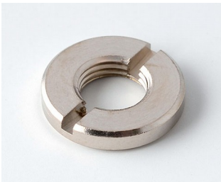
A6207009 Round nut M7 x 0.75