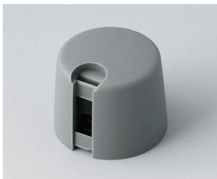
A1020648 TOP-KNOBS 20 PA 6 volcano 20x16mm