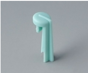
A1105005 Arrow PA 6 (UL 94 HB) lagoon