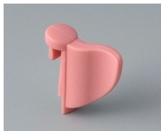
A1104003 Wing PA 6 (UL 94 HB) coral