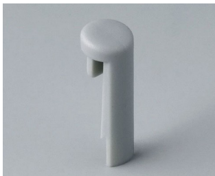
A1101007 Pin PA 6 (UL 94 HB) mineral