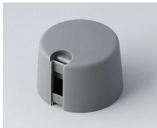
A1024648 TOP-KNOBS 24 PA 6 volcano 24x16mm