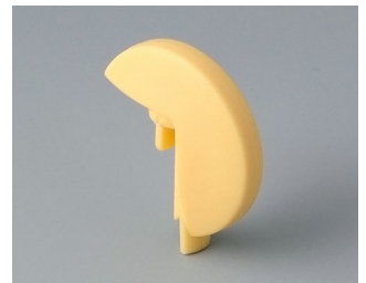
A1103004 Disk PA 6 (UL 94 HB) beach