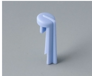
A1105006 Arrow PA 6 (UL 94 HB) sky