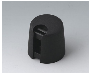
A1016649 TOP-KNOBS 16 PA 6 nero 16x16mm