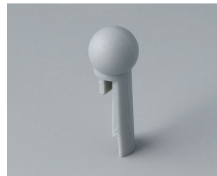
A1102007 Globe PA 6 (UL 94 HB) mineral