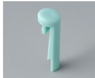
A1101005 Pin PA 6 (UL 94 HB) lagoon