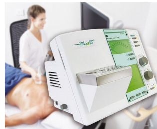
Operating element for a diagnostic device