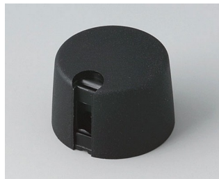
A1024649 TOP-KNOBS 24 PA 6 nero 24x16mm