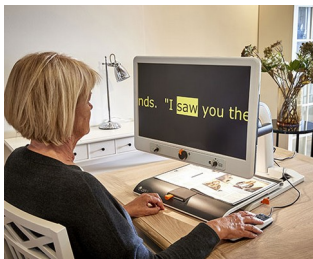
Control knobs for video magnifier