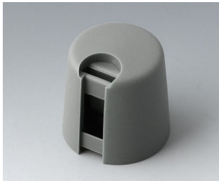
A1016648 TOP-KNOBS 16 PA 6 volcano 16x16mm