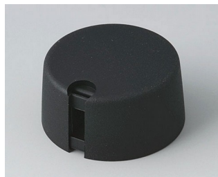
A1031649 TOP-KNOBS 31 PA 6 nero 31x16mm