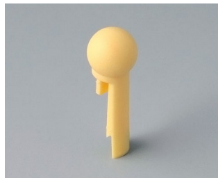
A1102004 Globe PA 6 (UL 94 HB) beach