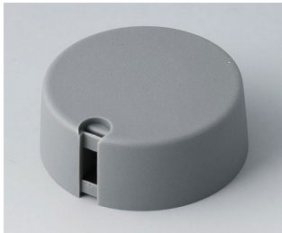
A1040648 TOP-KNOBS 40 PA 6 volcano 40x16mm