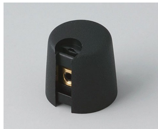
A1016049 TOP-KNOBS 16 PA 6 nero 16x16mm 4mm