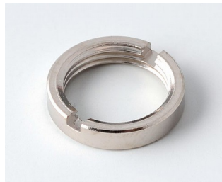
A6210009 Round nut M10 x 0.75