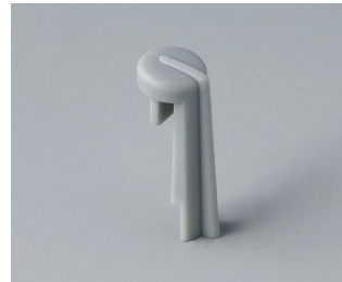
A1105007 Arrow PA 6 (UL 94 HB) mineral