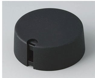
A1040649 TOP-KNOBS 40 PA 6 nero 40x16mm