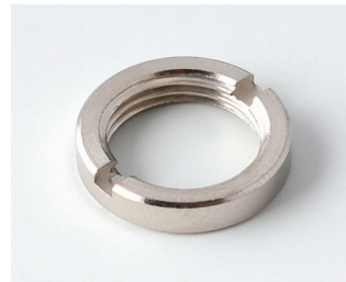
A6295009 Round nut 3/8"-32G

Subject to technical modification without notice. © by OKW Gehäusesysteme, Buchen/Germany.