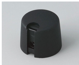
A1020649 TOP-KNOBS 20 PA 6 nero 20x16mm