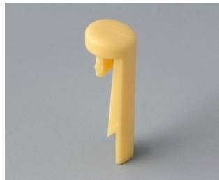
A1101004 Pin PA 6 (UL 94 HB) beach