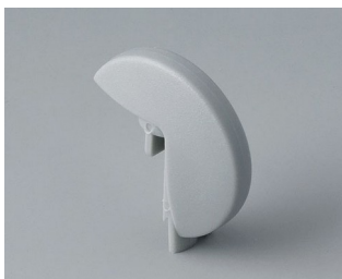
A1103007 Disk PA 6 (UL 94 HB) mineral