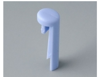
A1101006 Pin PA 6 (UL 94 HB) sky