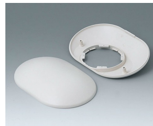
B5015307 Bottom and top part O160 H ABS (UL 94 HB) off-white RAL 9002 160x110x41mm