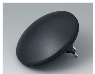
B5011329 ART-CASE R110 H PC+ABS (UL 94 V-0) black RAL 9005 ø110x41mm IP 40