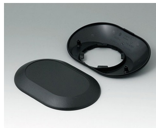
B5015209 Bottom and top part O160 F ABS (UL 94 HB) black RAL 9005 160x110x38mm