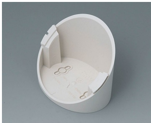
B5011317 Base 55° ABS (UL 94 HB) off-white RAL 9002