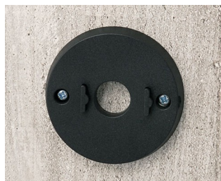
B5111309 Wall mounting set ABS (UL 94 HB) black RAL 9005