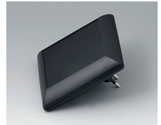
B5013229 ART-CASE S110 F PC+ABS (UL 94 V-0) black RAL 9005 110x110x38mm IP 40