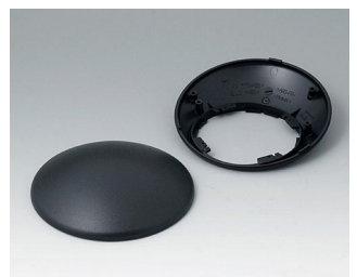
B5010309 Bottom and top part R110 H ABS (UL 94 HB) black RAL 9005 ø110x41mm