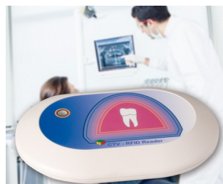
RFID Reader for the CTV system