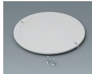
B5011847 Lid ABS (UL 94 HB) off-white RAL 9002