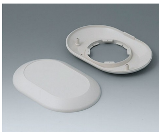
B5015007 Bottom and top part O160 F ABS (UL 94 HB) off-white RAL 9002 160x110x30mm