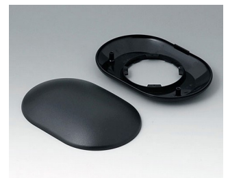
B5015109 Bottom and top part O160 H ABS (UL 94 HB) black RAL 9005 160x110x38mm