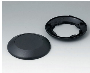
B5010009 Bottom and top part R110 F ABS (UL 94 HB) black RAL 9005 ø110x30mm