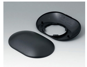
B5015309 Bottom and top part O160 H ABS (UL 94 HB) black RAL 9005 160x110x41mm