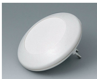
B5011227 ART-CASE R110 F PC+ABS (UL 94 V-0) off-white RAL 9002 ø110x38mm IP 40