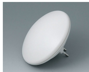
B5011127 ART-CASE R110 H PC+ABS (UL 94 V-0) off-white RAL 9002 ø110x38mm IP 40