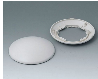
B5010107 Bottom and top part R110 H ABS (UL 94 HB) off-white RAL 9002 ø110x38mm