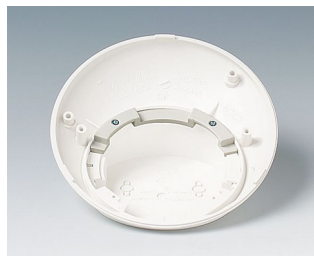
B5111707 Anti-rotation device ABS (UL 94 HB) off-white RAL 9002