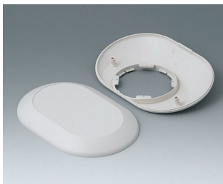
B5015207 Bottom and top part O160 F ABS (UL 94 HB) off-white RAL 9002 160x110x38mm