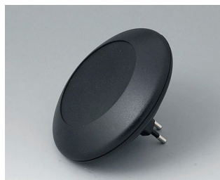
B5011029 ART-CASE R110 F PC+ABS (UL 94 V-0) black RAL 9005 ø110x30mm IP 40