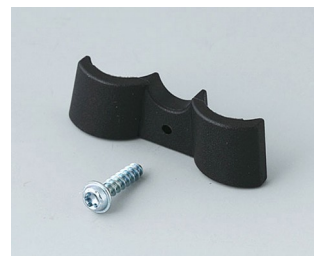
A9166003 Battery holder, 2 x AAA PA 6 (UL 94 HB) black RAL 9005