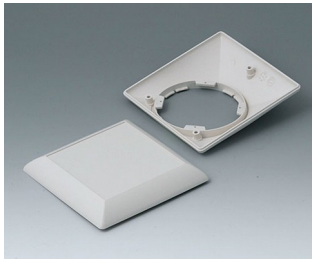
B5012207 Bottom and top part S110F ABS (UL 94 HB) off-white RAL 9002 110x110x38mm