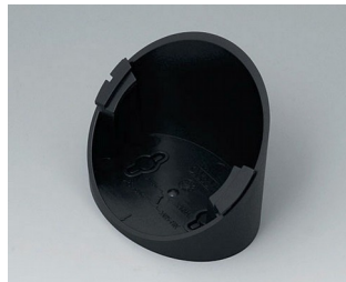
B5011319 Base 55° ABS (UL 94 HB) black RAL 9005