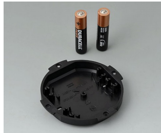
B5111109 Battery compartment, 2 x AAA ABS (UL 94 HB) black RAL 9005