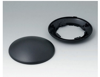
B5010109 Bottom and top part R110 H ABS (UL 94 HB) black RAL 9005 ø110x38mm