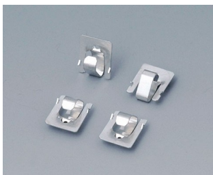
A9166001 Set of battery clips, 2 x AAA Steel tin-plated