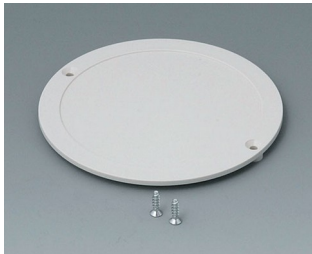
B5011857 Battery compartment lid ABS (UL 94 HB) off-white RAL 9002