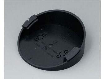
B5011219 Base 30° ABS (UL 94 HB) black RAL 9005