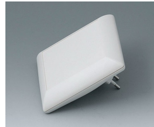
B5013227 ART-CASE S110 F PC+ABS (UL 94 V-0) off-white RAL 9002 110x110x38mm IP 40