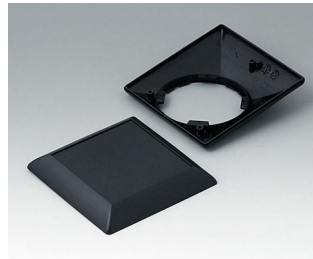
B5012209 Bottom and top part S110 F ABS (UL 94 HB) black RAL 9005 110x110x38mm