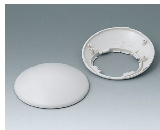
B5010307 Bottom and top part R110 H ABS (UL 94 HB) off-white RAL 9002 ø110x41mm