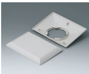
B5017207 Bottom and top part E160 F ABS (UL 94 HB) off-white RAL 9002 160x110x38mm