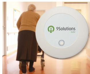
Access management in care facilities