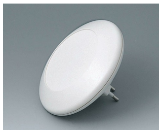
B5011027 ART-CASE R110 F PC+ABS (UL 94 V-0) off-white RAL 9002 ø110x30mm IP 40