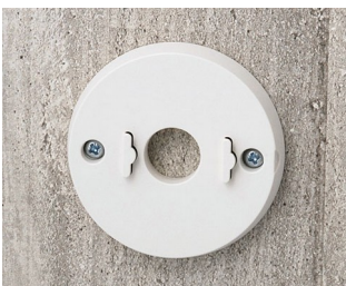
B5111307 Wall mounting set ABS (UL 94 HB) off-white RAL 9002