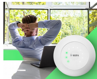
CO2 sensor traffic light