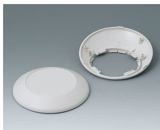
B5010207 Bottom and top part R110 F ABS (UL 94 HB) off-white RAL 9002 ø110x38mm