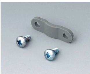
A9199005 Strain relief PA 6 volcano