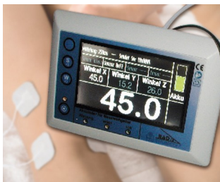
3D angle measurement of articulation systems on a gravity basis