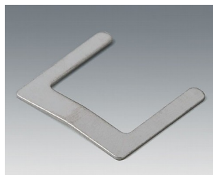
A9166002 Battery contact, 2 x AAA Steel tin-plated