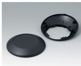
B5010209 Bottom and top part R110 F ABS (UL 94 HB) black RAL 9005 ø110x38mm