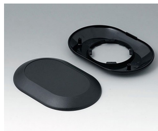
B5015009 Bottom and top part O160 F ABS (UL 94 HB) black RAL 9005 160x110x30mm