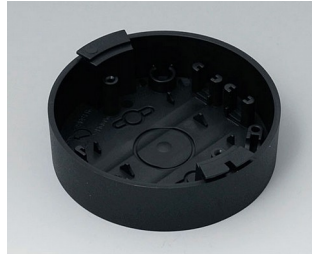
B5011119 Base ABS (UL 94 HB) black RAL 9005