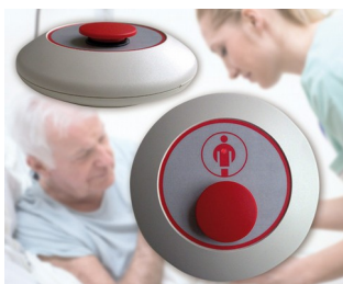
Radio paging mushroom-type button