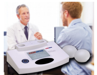
Multiple analytical resonance system