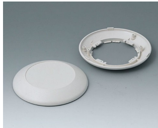
B5010007 Bottom and top part R110 F ABS (UL 94 HB) off-white RAL 9002 ø110x30mm