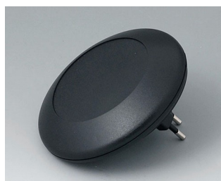
B5011229 ART-CASE R110 F PC+ABS (UL 94 V-0) black RAL 9005 ø110x38mm IP 40