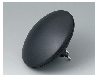
B5011129 ART-CASE R110 H PC+ABS (UL 94 V-0) black RAL 9005 ø110x38mm IP 40