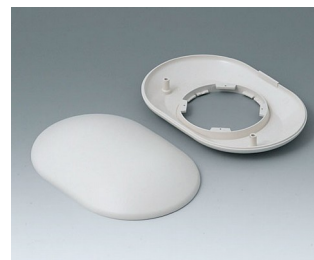
B5015107 Bottom and top part O160 H ABS (UL 94 HB) off-white RAL 9002 160x110x38mm