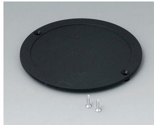
B5011859 Battery compartment lid ABS (UL 94 HB) black RAL 9005