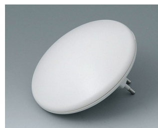
B5011327 ART-CASE R110 H PC+ABS (UL 94 V-0) off-white RAL 9002 ø110x41mm IP 40