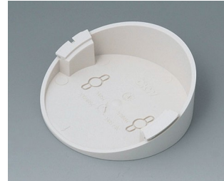
B5011217 Base 30° ABS (UL 94 HB) off-white RAL 9002