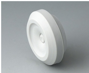
C2320147 Cable grommet TPE light grey RAL 7035 IP 67