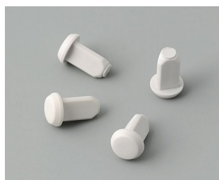
C2299018 Case feet TPE (UL 94 HB)