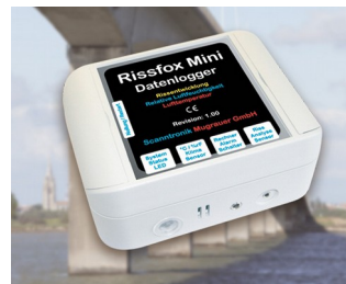
Miniature data logger for crack displacements and climatic data