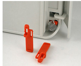
C6100016 Set of security PA 6 red