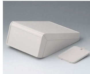
B4056227 UNITEC M, 1.4/0.6 ABS (UL 94 HB) off-white RAL 9002 148x210x80mm IP 40