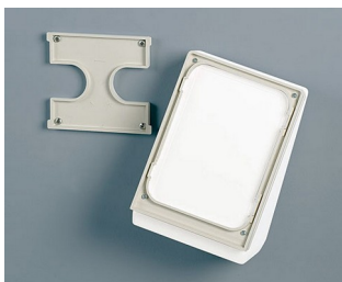
B4154307 Wall suspension element S off-white RAL 9002