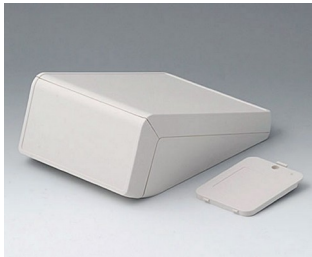
B4056207 UNITEC M, 0.6/0.6 ABS (UL 94 HB) off-white RAL 9002 148x210x80mm IP 40