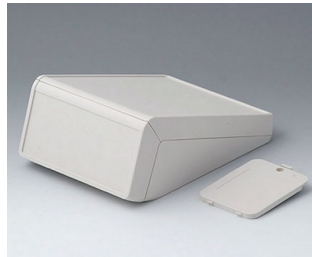
B4056217 UNITEC M, 1.4/1.4 ABS (UL 94 HB) off-white RAL 9002 148x210x80mm IP 40