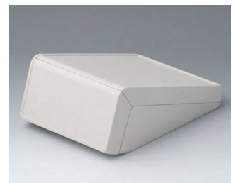
B4056137 UNITEC M, 0.6/1.4 ABS (UL 94 HB) off-white RAL 9002 148x210x80mm IP 40