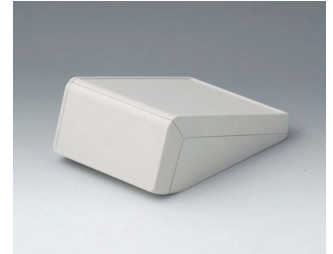
B4054137 UNITEC S, 0.6/1.4 ABS (UL 94 HB) off-white RAL 9002 125x177x69mm IP 40