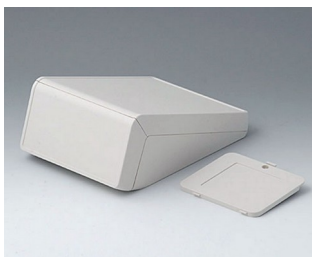
B4056307 UNITEC M, 0.6/0.6 ABS (UL 94 HB) off-white RAL 9002 148x210x80mm IP 40