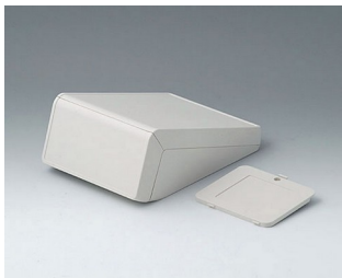
B4054307 UNITEC S, 0.6/0.6 ABS (UL 94 HB) off-white RAL 9002 125x177x69mm IP 40