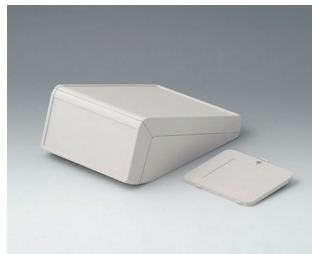
B4054317 UNITEC S, 1.4/1.4 ABS (UL 94 HB) off-white RAL 9002 125x177x69mm IP 40