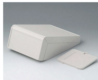
B4056327 UNITEC M, 1.4/0.6 ABS (UL 94 HB) off-white RAL 9002 148x210x80mm IP 40