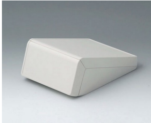
B4054107 UNITEC S, 0.6/0.6 ABS (UL 94 HB) off-white RAL 9002 125x177x69mm IP 40