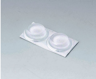
A9212330 Anti-slide feet 12 x 3.5 mm transparent

Subject to technical modification without notice. © by OKW Gehäusesysteme, Buchen/Germany.