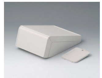
B4054237 UNITEC S, 0.6/1.4 ABS (UL 94 HB) off-white RAL 9002 125x177x69mm IP 40