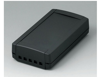
B1065469 TOPTEC 154 F, Vers. II ABS (UL 94 HB) black RAL 9005 154x84x38mm IP 40