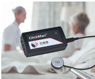
Adaptive multicontroller for single sensors