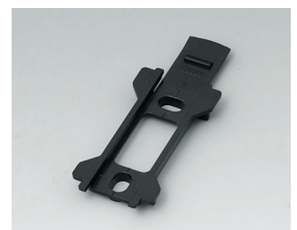
B1340029 Wall suspension element for Toptec 102 ABS (UL 94 HB) black RAL 9005