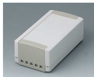
B1060465 TOPTEC 154 H, Vers. II ABS (UL 94 HB) off-white RAL 9002 154x84x56mm IP 40