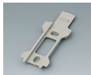
B1340028 Wall suspension element for Toptec 102 PC+ABS (UL 94 V-0) pebble grey RAL 7032