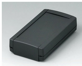
B1055369 TOPTEC 123 F, Vers. I ABS (UL 94 HB) black RAL 9005 123x68x30mm IP 40