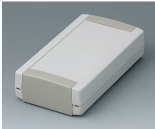
B1065365 TOPTEC 154 F, Vers. I ABS (UL 94 HB) off-white RAL 9002 154x84x38mm IP 40