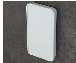
C6406107 SMART-PANEL E155 ASA+PC (UL 94 V-0) traffic white RAL 9016 155x84x21.3mm IP 40