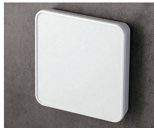
C6404107 SMART-PANEL S114 ASA+PC (UL 94 V-0) traffic white RAL 9016 114x114x21.3mm IP 40