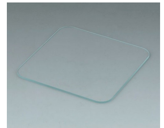
C6502013 Glass panel S84 Glass clear 78.75x78.75x1.6mm