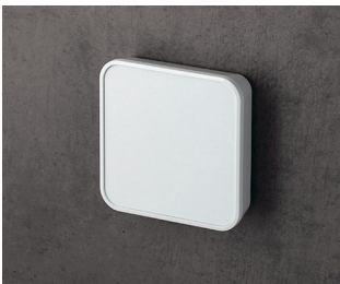
C6402107 SMART-PANEL S84 ASA+PC (UL 94 V-0) traffic white RAL 9016 84x84x21.3mm IP 40