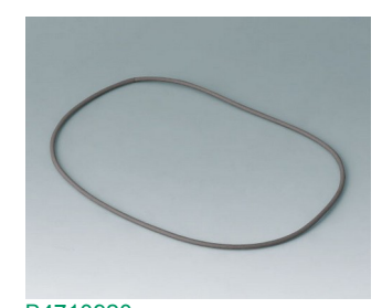
B4710920 Seal M