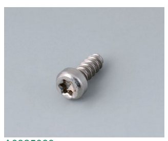
A0325060 Self-tapping screw 2.5 x 6 mm (T8) Stainless steel

Subject to technical modification without notice. © by OKW Gehäusesysteme, Buchen/Germany.