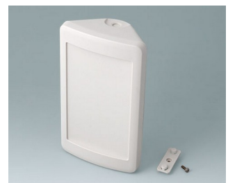
B4610207 SMART-CONTROL M, Vers. II ASA+PC (UL 94 V-0) off-white RAL 9002 173x101x59mm IP 40, IP 55 opt.