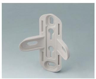
B4705907 Wall suspension element ASA+PC (UL 94 V-0)