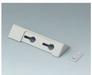
B4705207 Desktop stand set ASA+PC (UL 94 V-0)