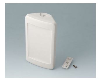
B4608207 SMART-CONTROL S, Vers. II ASA+PC (UL 94 V-0) off-white RAL 9002 142x81x46mm IP 40, IP 55 opt.