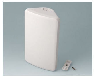
B4610107 SMART-CONTROL M, Vers. I ASA+PC (UL 94 V-0) off-white RAL 9002 173x101x59mm IP 40, IP 55 opt.