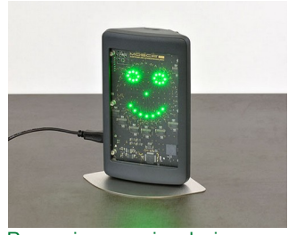
Room air measuring device