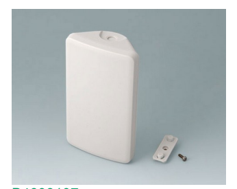
B4608107 SMART-CONTROL S, Vers. I ASA+PC (UL 94 V-0) off-white RAL 9002 142x81x46mm IP 40, IP 55 opt.