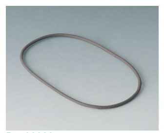
B4708920 Seal S