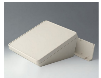
B4422207 PROTEC 220, Vers. II ASA+PC (UL 94 V-0) off-white RAL 9002 220x220x108mm IP 65 opt.