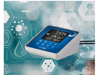
Laboratory measuring device