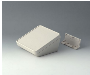
B4414207 PROTEC 140, Vers. II ASA+PC (UL 94 V-0) off-white RAL 9002 140x140x76mm IP 65 opt.