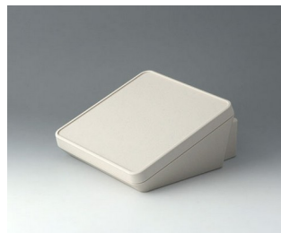
B4418307 PROTEC 180, Vers. III ASA+PC (UL 94 V-0) off-white RAL 9002 180x201x92mm IP 65 opt.