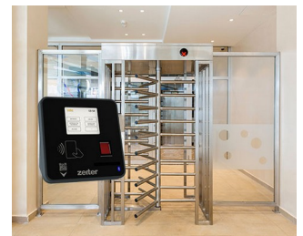
Terminal for access control