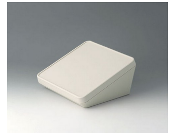
B4418107 PROTEC 180, Vers. I ASA+PC (UL 94 V-0) off-white RAL 9002 180x180x92mm IP 65 opt.