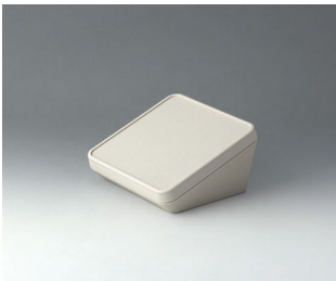
B4414107 PROTEC 140, Vers. I ASA+PC (UL 94 V-0) off-white RAL 9002 140x140x76mm IP 65 opt.