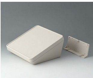
B4418207 PROTEC 180, Vers. II ASA+PC (UL 94 V-0) off-white RAL 9002 180x180x92mm IP 65 opt.