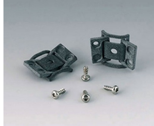
C8100360 Internal hinge set