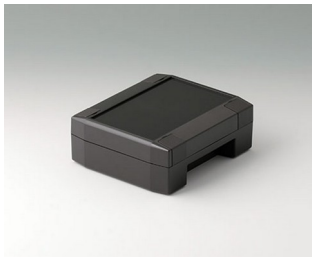
C8011131 SOLID-BOX 115 PC+ABS (UL 94 V-0) anthracite grey RAL 7016 135x115x50mm IP 66, IP 67, IK 08