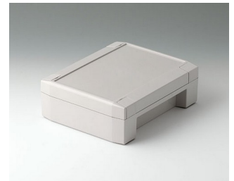
C8014182 SOLID-BOX 145 PC+ABS (UL 94 V-0) light grey RAL 7035 180x145x60mm IP 66, IP 67, IK 08