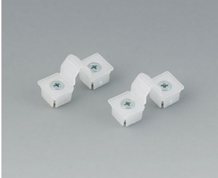
C2299031 Securing hinge for the cover PP natural-coloured