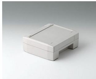
C8011132 SOLID-BOX 115 PC+ABS (UL 94 V-0) light grey RAL 7035 135x115x50mm IP 66, IP 67, IK 08