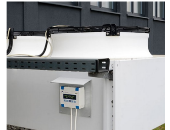
Heating/air conditioning/ventilation control