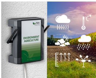
Weather station in agriculture