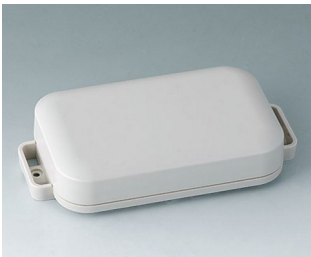
C3207107 EASYTEC 125 ASA+PC (UL 94 V-0) off-white RAL 9002 147x78x30mm IP 65 opt., IP 40