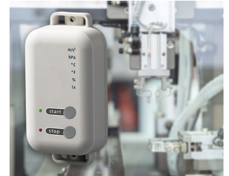
Data logger with gateway function