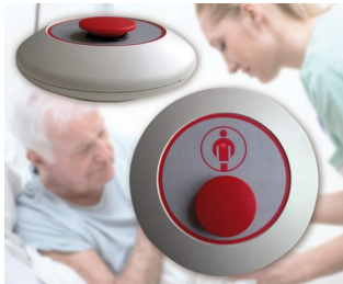
Radio paging mushroom-type button