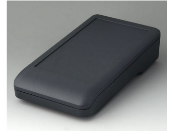
A9007118 DATEC-COMPACT L ASA+PC (UL 94 V-0) lava 206x110x47mm IP 41