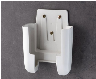
A9107627 Holder L ASA+PC (UL 94 V-0) off-white RAL 9002