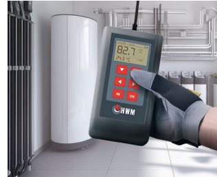
Measuring device for heating water