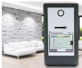
Spectral light meter