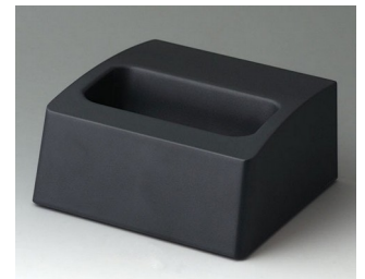
A9106508 Station M ASA+PC (UL 94 V-0) lava