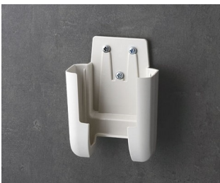
A9105627 Holder S ASA+PC (UL 94 V-0) off-white RAL 9002