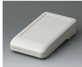
A9005117 DATEC-COMPACT S ASA+PC (UL 94 V-0) off-white RAL 9002 136x74x32mm IP 41