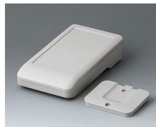
A9005217 DATEC-COMPACT S ASA+PC (UL 94 V-0) off-white RAL 9002 136x74x32mm IP 41