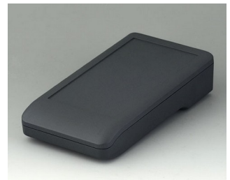
A9006118 DATEC-COMPACT M ASA+PC (UL 94 V-0) lava 172x92x39mm IP 41