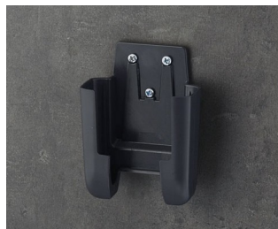
A9105628 Holder S ASA+PC (UL 94 V-0) lava