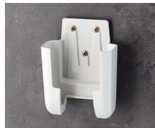
A9106627 Holder M ASA+PC (UL 94 V-0) off-white RAL 9002