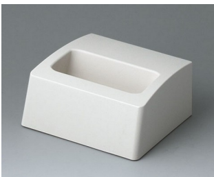
A9105507 Station S ASA+PC (UL 94 V-0) off-white RAL 9002