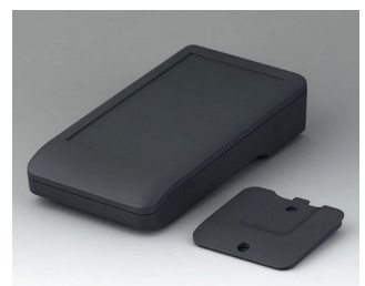
A9006218 DATEC-COMPACT M ASA+PC (UL 94 V-0) lava 172x92x39mm IP 41