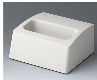
A9106507 Station M ASA+PC (UL 94 V-0) off-white RAL 9002