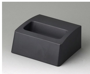
A9105508 Station S ASA+PC (UL 94 V-0) lava