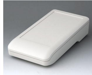
A9007117 DATEC-COMPACT L ASA+PC (UL 94 V-0) off-white RAL 9002 206x110x47mm IP 41