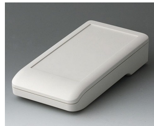
A9006117 DATEC-COMPACT M ASA+PC (UL 94 V-0) off-white RAL 9002 172x92x39mm IP 41