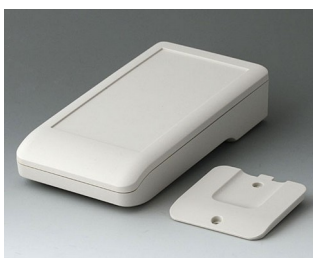
A9006207 DATEC-COMPACT M ASA+PC (UL 94 V-0) off-white RAL 9002 172x92x39mm IP 65