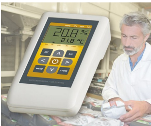
Atmospheric oxygen measuring unit