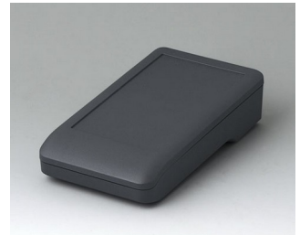
A9005118 DATEC-COMPACT S ASA+PC (UL 94 V-0) lava 136x74x32mm IP 41