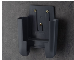
A9107628 Holder L ASA+PC (UL 94 V-0) lava