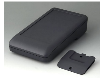
A9007218 DATEC-COMPACT L ASA+PC (UL 94 V-0) lava 206x110x47mm IP 41