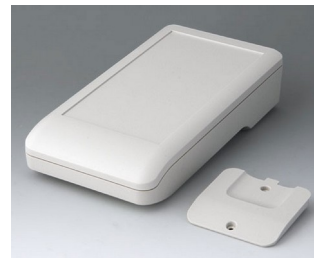
A9007217 DATEC-COMPACT L ASA+PC (UL 94 V-0) off-white RAL 9002 206x110x47mm IP 41