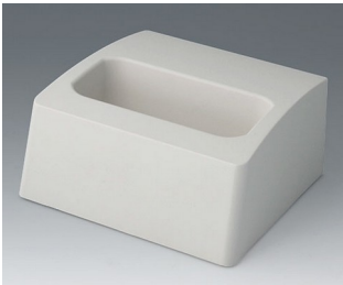
A9107507 Station L ASA+PC (UL 94 V-0) off-white RAL 9002