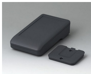
A9005208 DATEC-COMPACT S ASA+PC (UL 94 V-0) lava 136x74x32mm IP 65