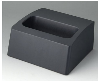
A9107508 Station L ASA+PC (UL 94 V-0) lava