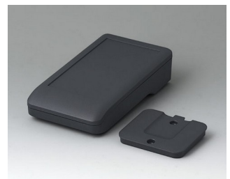
A9005218 DATEC-COMPACT S ASA+PC (UL 94 V-0) lava 136x74x32mm IP 41