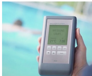
Electronic pool tester