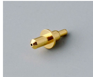
A9193031 Spring contact gold-plated