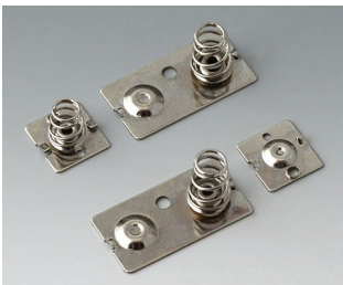
A9190023 Set of battery clips, 3 x AA Steel nickel-plated