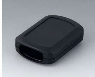
B2832109 CONNECT ASA+PC-FR (UL 94 V-0) black RAL 9005 76x54x22mm