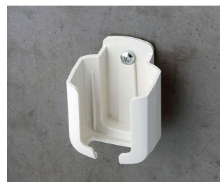
B2921507 Holder S ASA+PC (UL 94 V-0) off-white RAL 9002