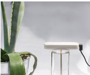
Tool for making colloidal silver solutions