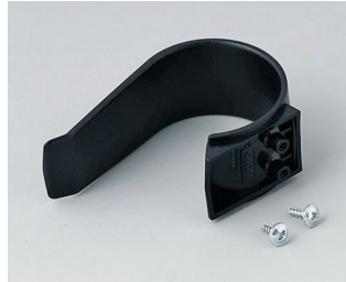
A9167029 Holding clamp PA 6 (UL 94 HB) black RAL 9005