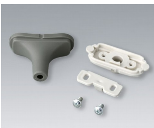
B2911318 Cable gland kit, 4.2 - 5.0 SEBS (TPE) volcano