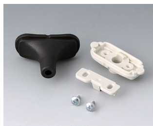
B2911319 Cable gland kit, 4.2 - 5.0 SEBS (TPE) black RAL 9005