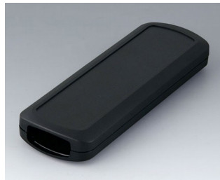
B2834109 CONNECT ASA+PC-FR (UL 94 V-0) black RAL 9005 156x54x22mm