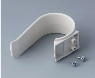
A9167027 Holding clamp PA 6 (UL 94 HB) off-white RAL 9002