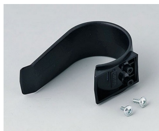
A9167029 Holding clamp PA 6 (UL 94 HB) black RAL 9005