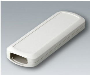
B2834107 CONNECT ASA+PC-FR (UL 94 V-0) off-white RAL 9002 156x54x22mm