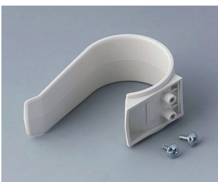
A9167027 Holding clamp PA 6 (UL 94 HB) off-white RAL 9002