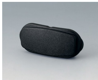
B2811209 End part ASA+PC-FR (UL 94 V-0) black RAL 9005