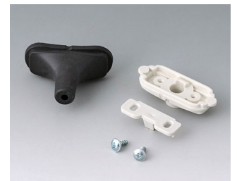
B2911309 Cable gland kit, 3.4 - 4.2 SEBS (TPE) black RAL 9005