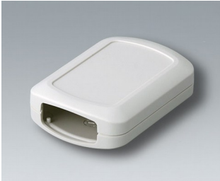
B2832107 CONNECT ASA+PC-FR (UL 94 V-0) off-white RAL 9002 76x54x22mm