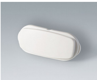
B2811207 End part ASA+PC-FR (UL 94 V-0) off-white RAL 9002