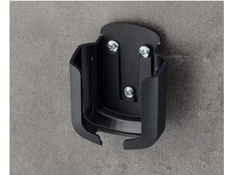
B2931509 Holder ASA+PC-FR (UL 94 V-0) black RAL 9005