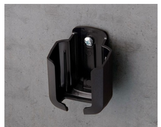
B2921509 Holder S ASA+PC (UL 94 V-0) black RAL 9005