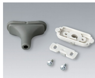
B2911328 Cable gland kit, 5.0 - 5.9 SEBS (TPE) volcano