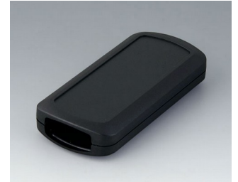
B2833109 CONNECT ASA+PC-FR (UL 94 V-0) black RAL 9005 116x54x22mm