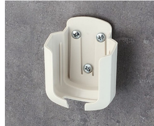
B2931507 Holder ASA+PC-FR (UL 94 V-0) off-white RAL 9002