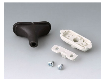
B2911329 Cable gland kit, 5.0 - 5.9 SEBS (TPE) black RAL 9005