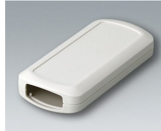
B2833107 CONNECT ASA+PC-FR (UL 94 V-0) off-white RAL 9002 116x54x22mm