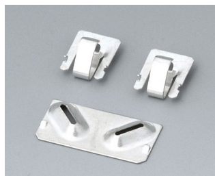
A9190002 Set of battery clips, 2xN/2xAA/2xAAA Steel tin-plated