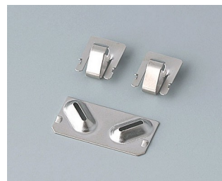
A9190003 Set of battery clips, 2xN/2xAA/2xAAA Steel nickel-plated