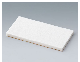
A9250251 Battery spacer PE foam 50x25x3mm