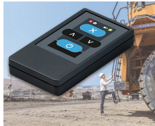
Radio transmitter for machines