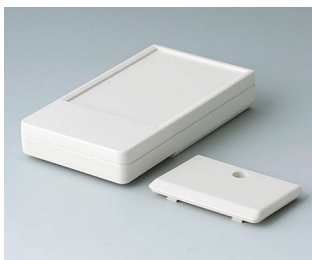
A9071117 DATEC-POCKET-BOX M ABS (UL 94 HB) off-white RAL 9002 105x58x18.5mm IP 54