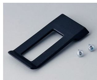
A9172109 Belt/Pocket clip ABS (UL 94 HB) black RAL 9005 62x30mm