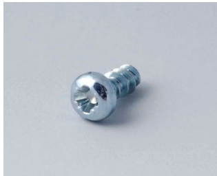
A0305031 Self-tapping screws 2.5 x 6 mm (PZ1)

Subject to technical modification without notice. © by OKW Gehäusesysteme, Buchen/Germany.