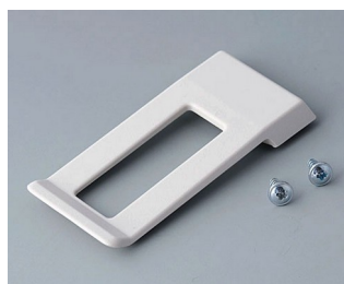
A9172107 Belt/Pocket clip ABS (UL 94 HB) off-white RAL 9002 62x30mm