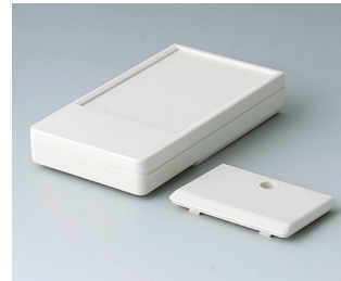
A9071107 DATEC-POCKET-BOX M ABS (UL 94 HB) off-white RAL 9002 105x58x18.5mm IP 41