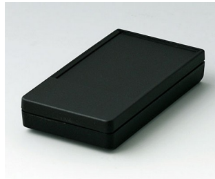
A9070219 DATEC-POCKET-BOX S PMMA (IR) (UL 94 HB) black RAL 9005 85x46x16mm IP 54