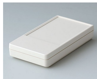
A9070117 DATEC-POCKET-BOX S ABS (UL 94 HB) off-white RAL 9002 85x46x16mm IP 54