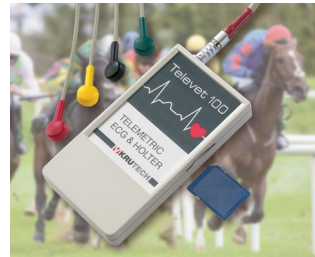
Telemetric ECG system for veterinary medicine