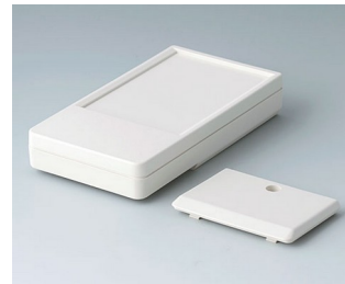
A9072117 DATEC-POCKET-BOX L ABS (UL 94 HB) off-white RAL 9002 120x65x22mm IP 54