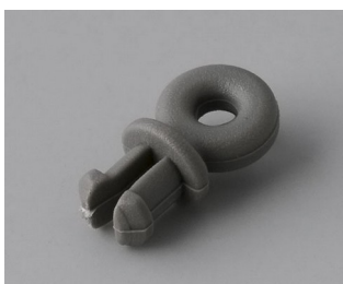
A9100001 Ring eyelet PA 6 volcano