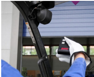
IR remote control for harsh environments

Especially suitable for measuring and control technology, remote controls, pulse generator for ultra-sound and infra-red, sensors, optoelectronics, mobile data recording, wireless communications, etc.