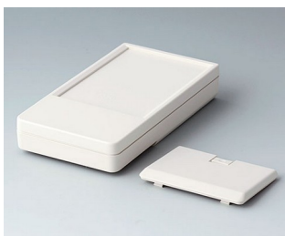
A9072127 DATEC-POCKET-BOX L ABS (UL 94 HB) off-white RAL 9002 120x65x22mm IP 41