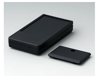
A9071219 DATEC-POCKET-BOX M PMMA (IR) (UL 94 HB) black RAL 9005 105x58x18.5mm IP 54