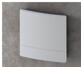
B3222201 NET-BOX 220, Vers. II ASA+PC (UL 94 V-0) light grey RAL 7035 220x220x50.5mm IP 65 opt.