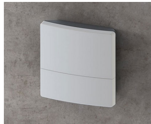
B3214201 NET-BOX 140, Vers. II ASA+PC (UL 94 V-0) light grey RAL 7035 140x140x46.5mm IP 65 opt.