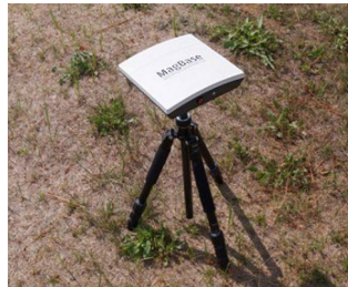
Measuring station for stationary field measurements