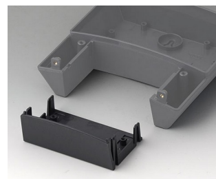
B3314918 Infill cover 140 ASA+PC (UL 94 V-0) lava