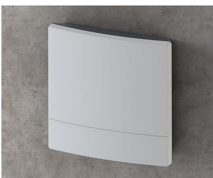
B3222101 NET-BOX 220, Vers. I ASA+PC (UL 94 V-0) light grey RAL 7035 220x220x50.5mm IP 65 opt., IP 40