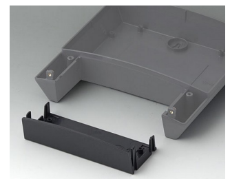
B3318918 Infill cover 180 ASA+PC (UL 94 V-0) lava