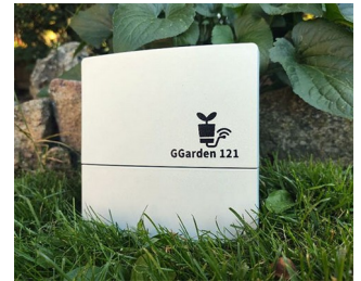
Intelligent Irrigation System