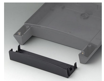
B3322918 Infill cover 220 ASA+PC (UL 94 V-0) lava