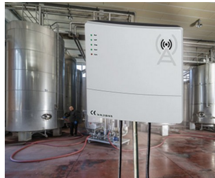
Gateway for the automation of production plants