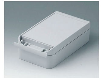
C6011201 SMART-BOX WIDTH 110 ASA+PC (UL 94 V-0) light grey RAL 7035 200x110x60mm IP 66