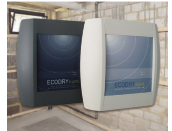
Systems for drying brickwork