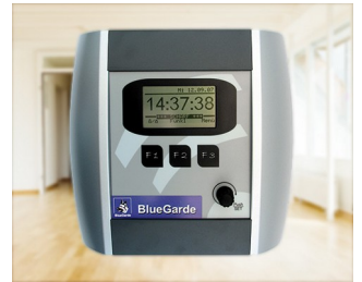
House control unit