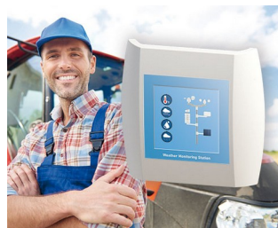
Weather Monitoring Station