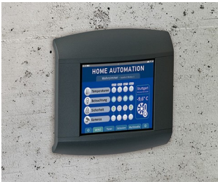
Control panel for home automation

Peripheral equipment for computers, IoT/IloT, gateways, data system engineering, systems for data collection on the job, access and security controls, measuring and controlling devices, medical, wellness and laboratory technology, etc.