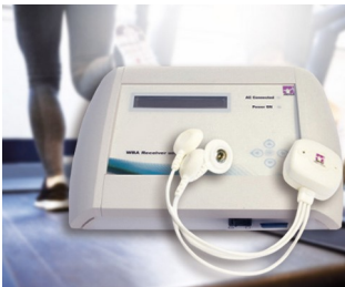
WBA receiver unit for measuring biosignals