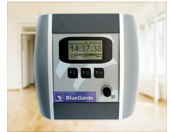
House control unit