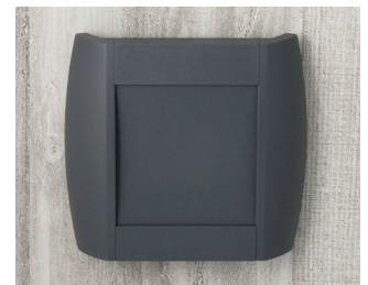
A9093108 DIATEC S ABS (UL 94 HB) lava 210x48x200mm IP 40