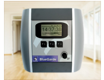
House control unit