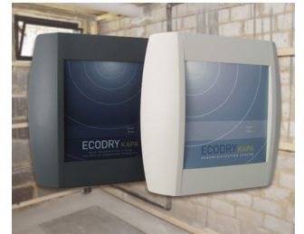
Systems for drying brickwork