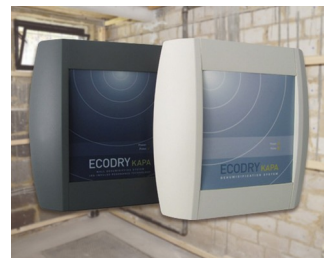
Systems for drying brickwork