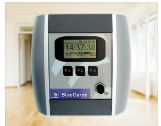
House control unit