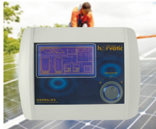
Control unit for photovoltaic solar installations