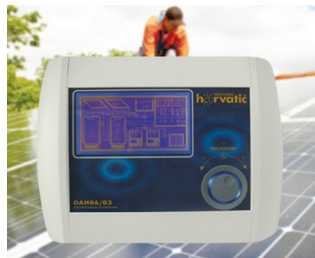
Control unit for photovoltaic solar installations