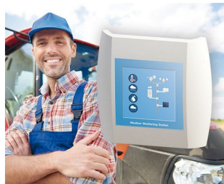
Weather Monitoring Station