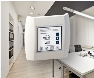
Indoor air quality control