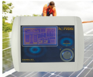
Control unit for photovoltaic solar installations