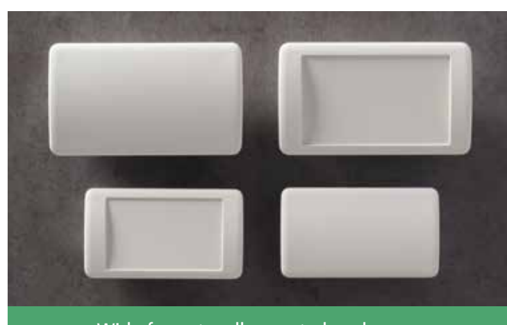
Wide format wall mounted enclosures