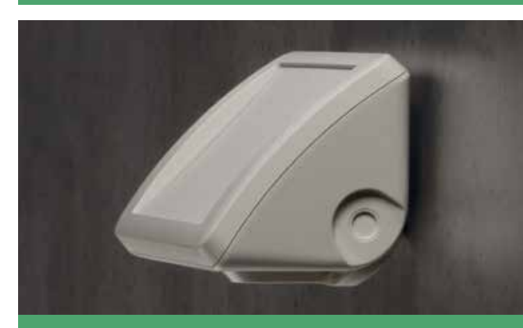
Wall mounted application with ergonomic operation area