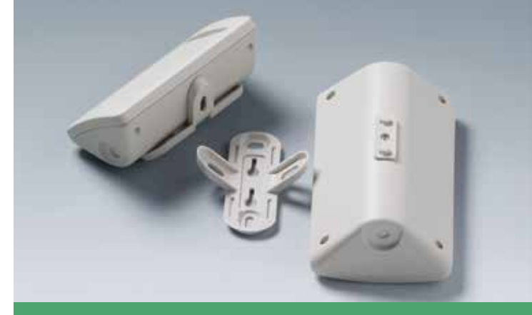
Enclosures with adapter and wall suspension element

Regular readers of this blog will know that opting for a customised version of a standard enclosure is always quicker and more cost-effective than specifying a fully bespoke housing. EASYTEC, EVOTEC and SMART-CONTROL are available in off-white (RAL 9002) ASA+PC-FR as standard. Custom colours are available on request. Other customisation options include CNC machining, lacquering, printing, laser marking, décor foils, EMC shielding and installation/assembly.