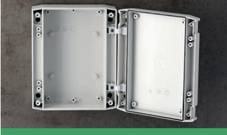
Integrated mounting points and hinge set