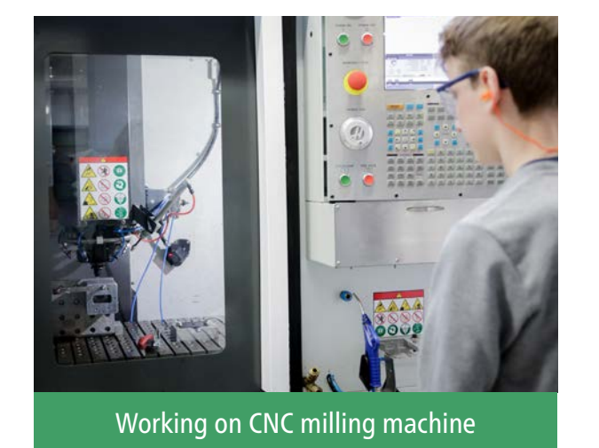
With the guidance and support of OKW's employees, they created a moneybox from a SYNERGY enclosure. The work included project planning, processing and customisation.

In addition to learning the basics needed in a workshop, the 12 participants were able to try out their technical skills in small projects at OKW and apply what they had learned.